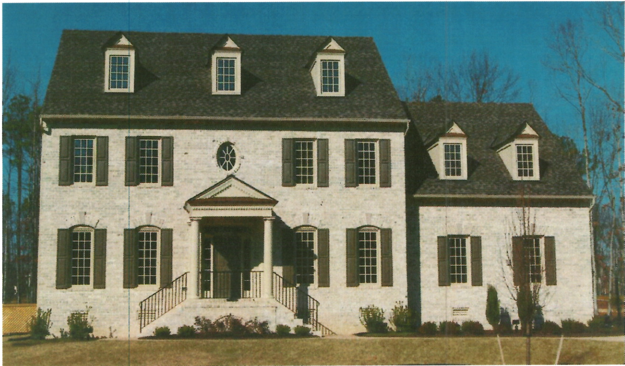
ELEVATION "B" SHOWN