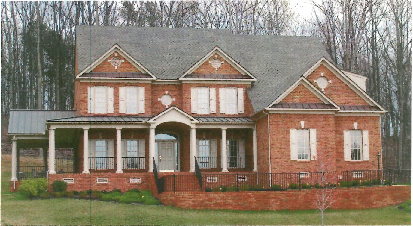
ELEVATION "A" SHOWN