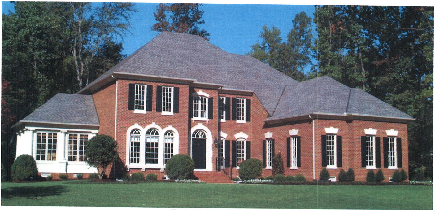
ELEVATION "A" SHOWN