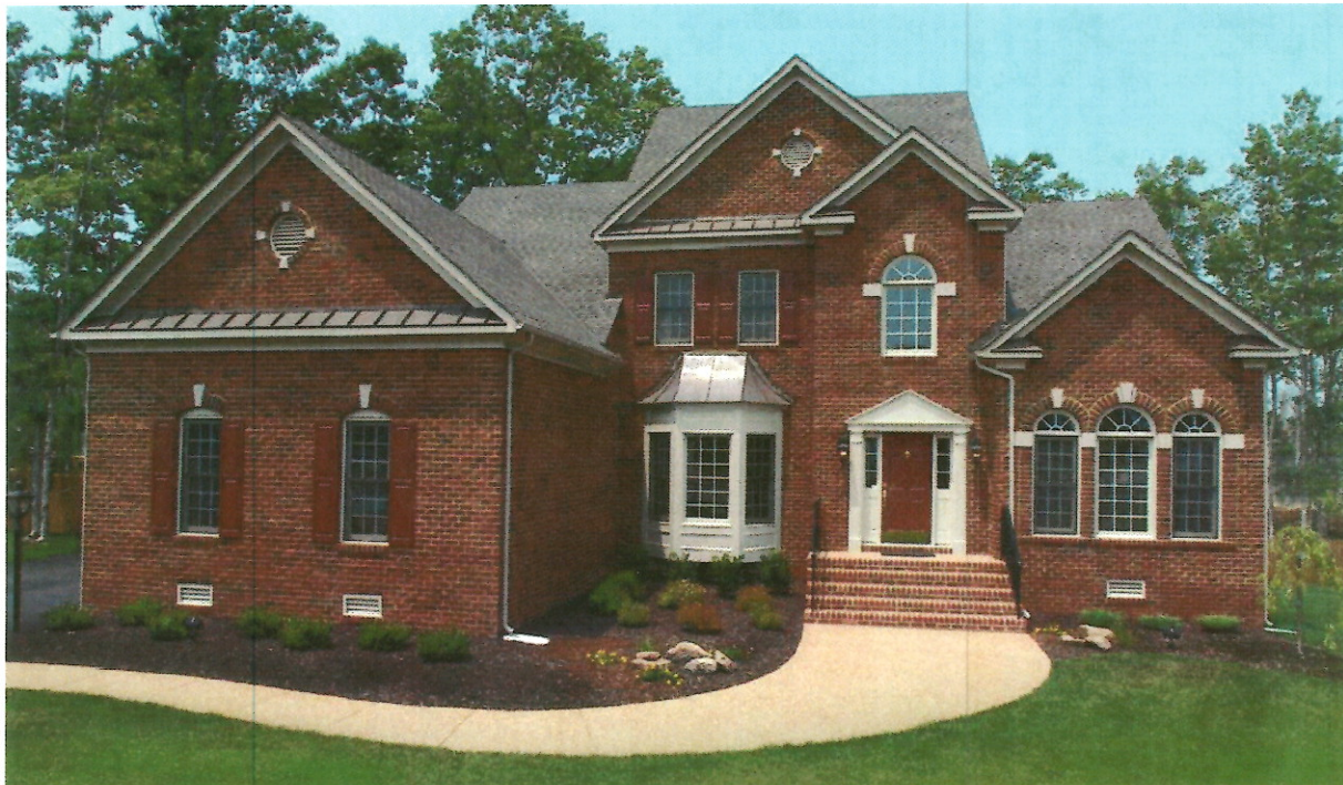
ELEVATION "A" SHOWN