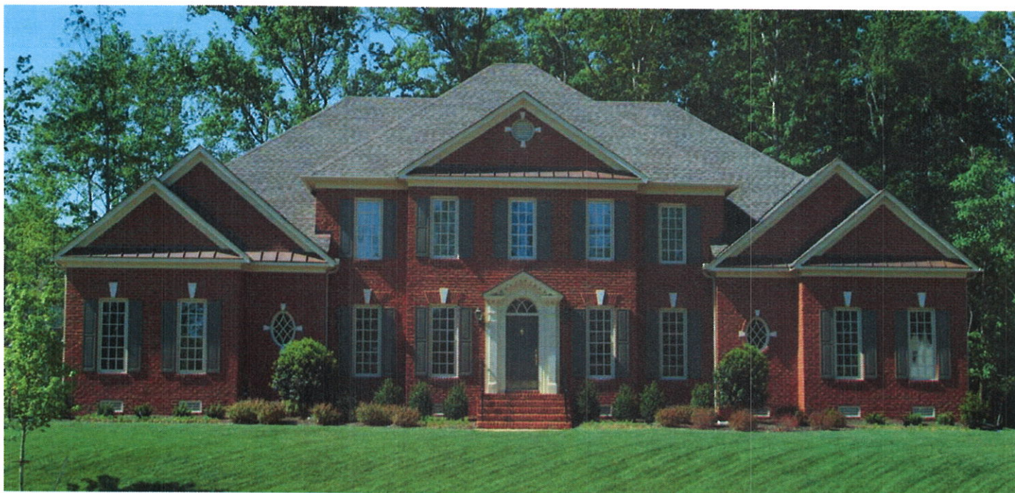
ELEVATION "A" SHOWN