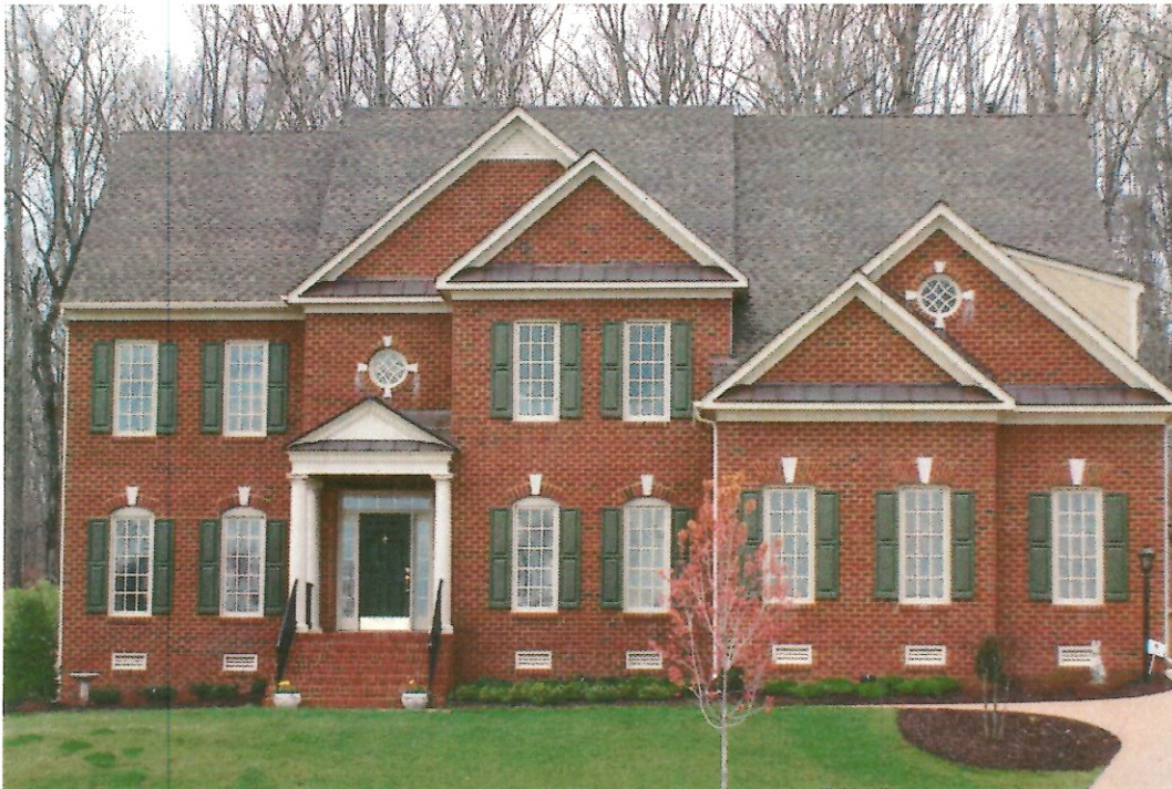
ELEVATION "E" SHOWN