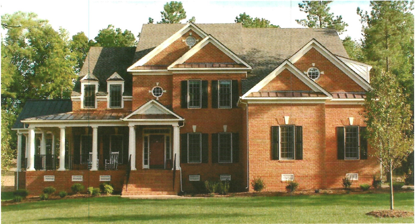
ELEVATION "C" SHOWN