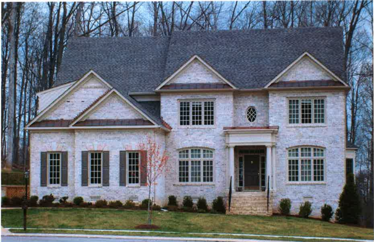
ELEVATION "L" SHOWN