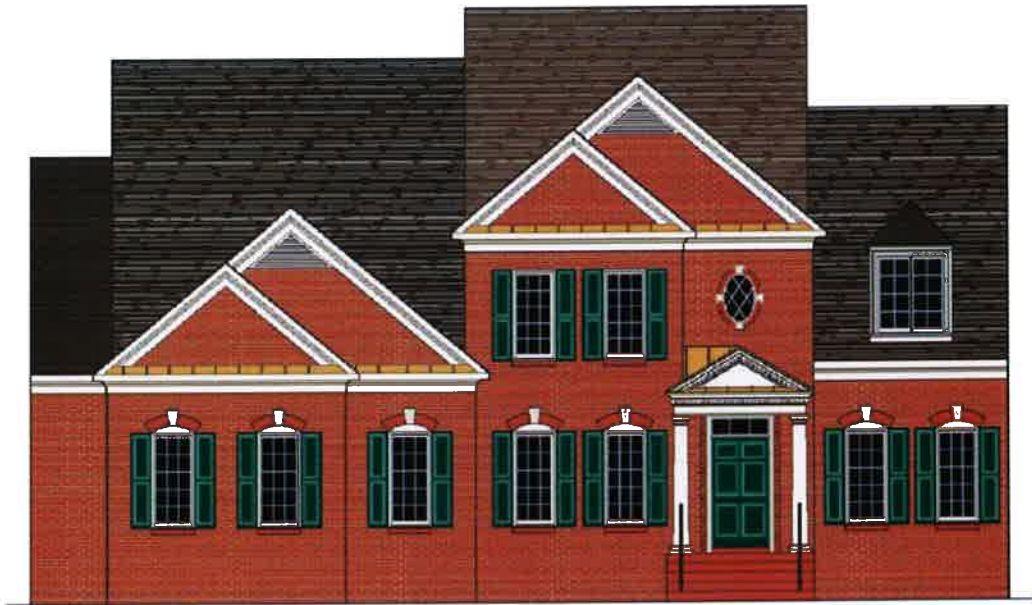
ELEVATION "A" SHOWN